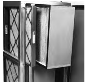
Two-inch AAF AmAir® pleated filters are shown installed in the prefilter track on the upstream end of the housing in front of AstroCel® HCX final filters.

Type S housings are available with a 2" or 4" wide prefilter track. Blank off panels are provided to prevent prefilter bypass. Prefilters are accessed through the final filter access door.