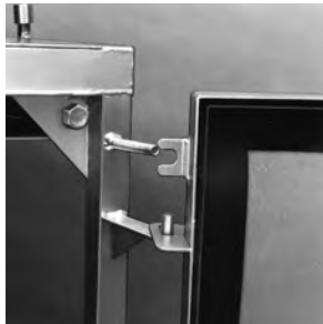
AstroSeal® Type S housing with access door open shows how the door rests on the pin hinge. The locking bolt and large gasket on the inside of the door are also shown.

Reinforced Doors: Standard 2"-deep hinged access doors have internal welded reinforcement. The unique pin-type hinge allows the doors to be precisely aligned prior to closure. A large, 1½" wide neoprene rubber gasket surface forms the proper seal with "finger pressure" locking knobs. Each door has two large welded handles for ease of opening or lift off.