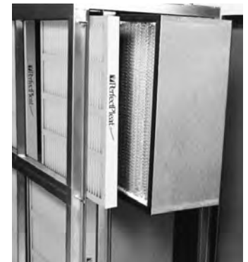
Two-inch PerfectPleat® pleated filters are shown installed in the prefilter track on the upstream end of the housing in front of AstroCel® HCX final filters.

HVAC HEPA housings are available with a 2" or 4" wide prefilter track. Blank-off panels are provided to prevent prefilter bypass. Prefilters are accessed through the final filter access door.