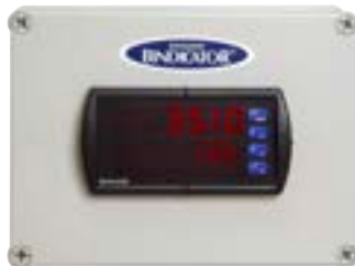
PRD1000 in NEMA 4X Enclosure

MSZ EN 60079-0:2013 MSZ EN 60079-0:2013/A11:2014 MSZ EN 60079-11:2012