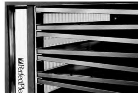
Side Access Carbon, side view, showing "V" bank trays.

Each Side Access Carbon tray is furnished with 45 pounds of activated charcoal per 1,000 CFM of rated capacity. The retention time of the gas stream at the rated flow of 500 FPM is 0.09 seconds. Retention time can be increased by installing multiple housings in series or in parallel, or reducing the flow rate. The trays have a removable end cap which allows them to be refilled with fresh adsorbent on site. If desired, the emptied trays can be returned for refill.